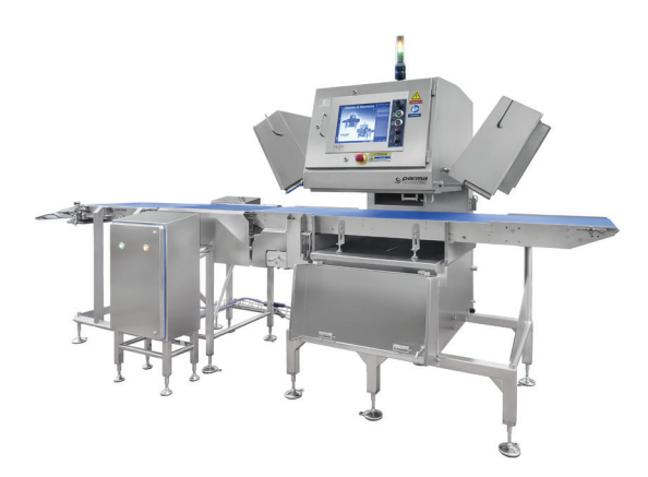
Figure 3: The Eagle RMI3/B unit has been engineered and built with American NAMI and European EHEDG standards with IP69 ingress protection. The machine's lourvers open fully making washdown operations—even under intense, high pressure and temperatures—simple, fast and can be completed by one person in a few minutes.

Figure 2: One of the most difficult problems to solve was ensuring that the transfer from the upstream machine (forming machine) towards the downstream belt was done without affecting the shape and thickness of each figure. It had to leave the product intact, in this particularly delicate phase. The designed solution had very small rollers (22 mm) enabling the internal transport of product, allowing a smooth and gradual passage in all conditions, even at high speeds.